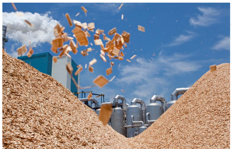
Biomass residues are underutilised and demonstrate potential as a renewable energy source

The project scored well because, in addition to making contributions to the Department of Trade and Industry's growth sector of biotechnology (biofuels), it demonstrates environmental benefits by being a carbon-negative process and presents job creation potential.