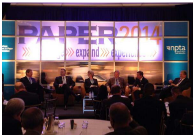
Industry leaders Exchange thoughts about its future