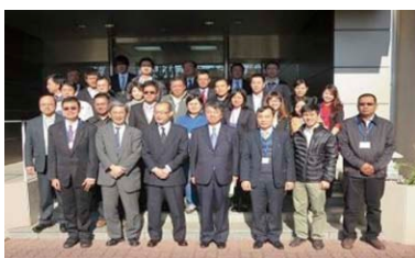
Industry players from Malaysia, Thailand and Vietnam attended the workshop

JPA hosted a workshop on paper recycling system in late December, gathering industry players from Malaysia, Thailand and Vietnam. With the support of the Ministry of Economy, Trade and Industry (METI) and The Overseas Human Resources and Industry Development Association (HIDA), the event involved lectures about the history of paper recycling in Japan, improving efforts for paper recycling by paper manufacturers, recovered paper collectors/distributors and governments, related laws and regulations, and paper mill visits.