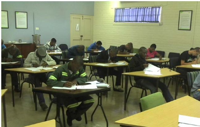
Students take examination at the Mpac's Felixton mill

The South African pulp and paper industry has been working with the Fibre Processing and Manufacturing (FP&M) Sector Education Training Authority (Seta) and a number of Further Education and Training (FET) colleges to provide education for full-time employees who wanted to further their studies in the pulp and paper field.